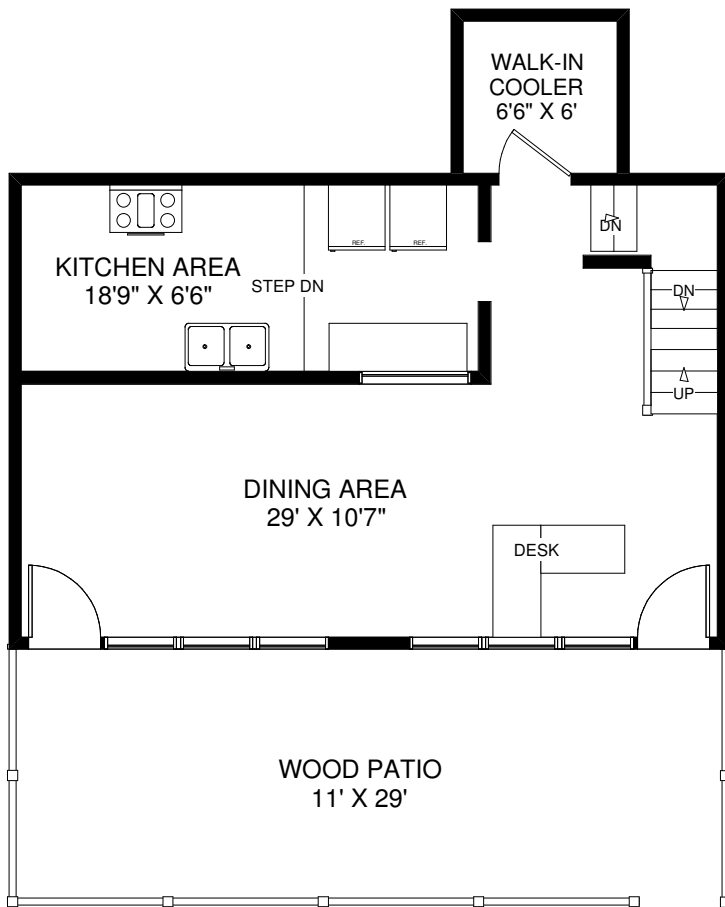
MAIN FLOOR APPROXIMATELY 689 SQ FT INCLUDING COOLER